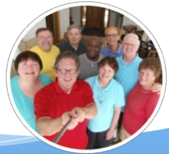
Learning Community 2015

As an intentional learning community, we are peers gathering together to provide mutual support for learning, reflection, support and growth. All of the learning/teaching is done by the participants. Each attendee is responsible for a two-hour presentation and/or discussion on a book, process, best practice or experience related to executive or church work, or faith. The whole agenda is flexible to allow participants to set the group learning rate and schedule. Spouses are welcome to attend any or all of the learning events as auditors.